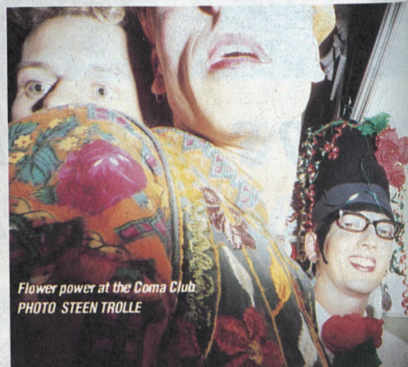
Flower power at the Coma Club