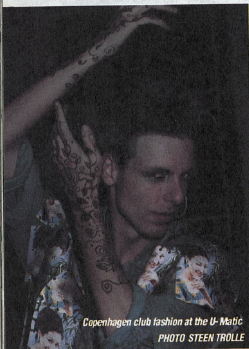
Copenhagen club fashion at the U-Matic