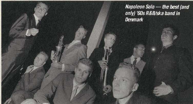
Napoleon Solo — the best (and only) '60s R&B/ska band in Denmark

and have just completed an LP 'Oprab (Til Det Danske Folk)' produced by the Coma's DJ Kenneth Baker. The album combines an uncompromising political message, ranting against the inertia of Denmark's politicians, and a melange of dance sounds including house, speed metal, rare groove and go go. Rapped almost entirely in Danish it is one of the strongest European rap LPs yet. Rockers By Choice are scheduled to play in Russia shortly. The Nordic rap invasion of the world has already begun.